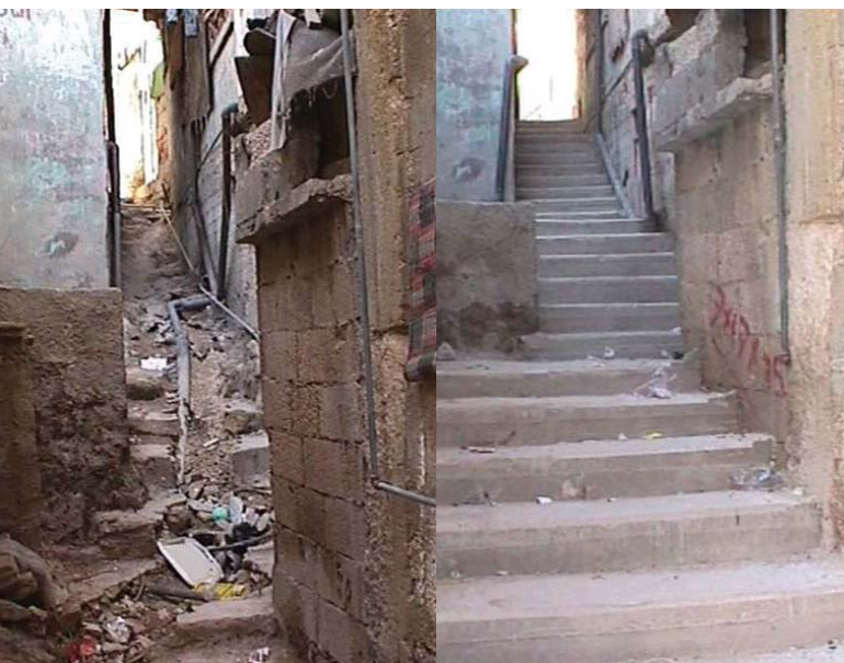
New paths and stairs (right) facilitate free movement of people and goods in the camps and settlements.