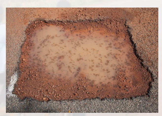
While waiting for maintenance work to start, road authorities cut potholes into rectangular shapes. This temporary measure helps to disperse any water that has collected across a larger area, which reduces the extent to which it deepens the hole.

It is not cheap: Mali needs about US$104,000 a year to maintain the Sikasso–Burkina Faso road alone.