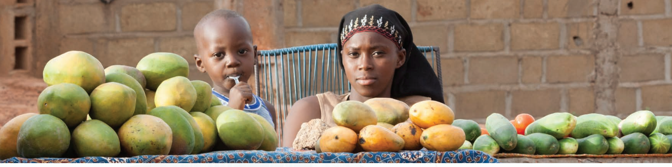
This fruit and vegetable stall is one of many small businesses cropping up along the Sikasso road.