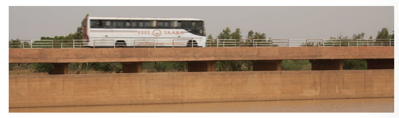
The new dam carries the Kaya–Dori road and increases the capacity of the reservoir.

But the road has made an even bigger difference to people in Yalgo, she says. "Before the road was built, we couldn't travel when the river was flooded. It was dangerous and some people drowned trying to cross it. Now we can travel to and from Kaya and Ouagadougou all year round."